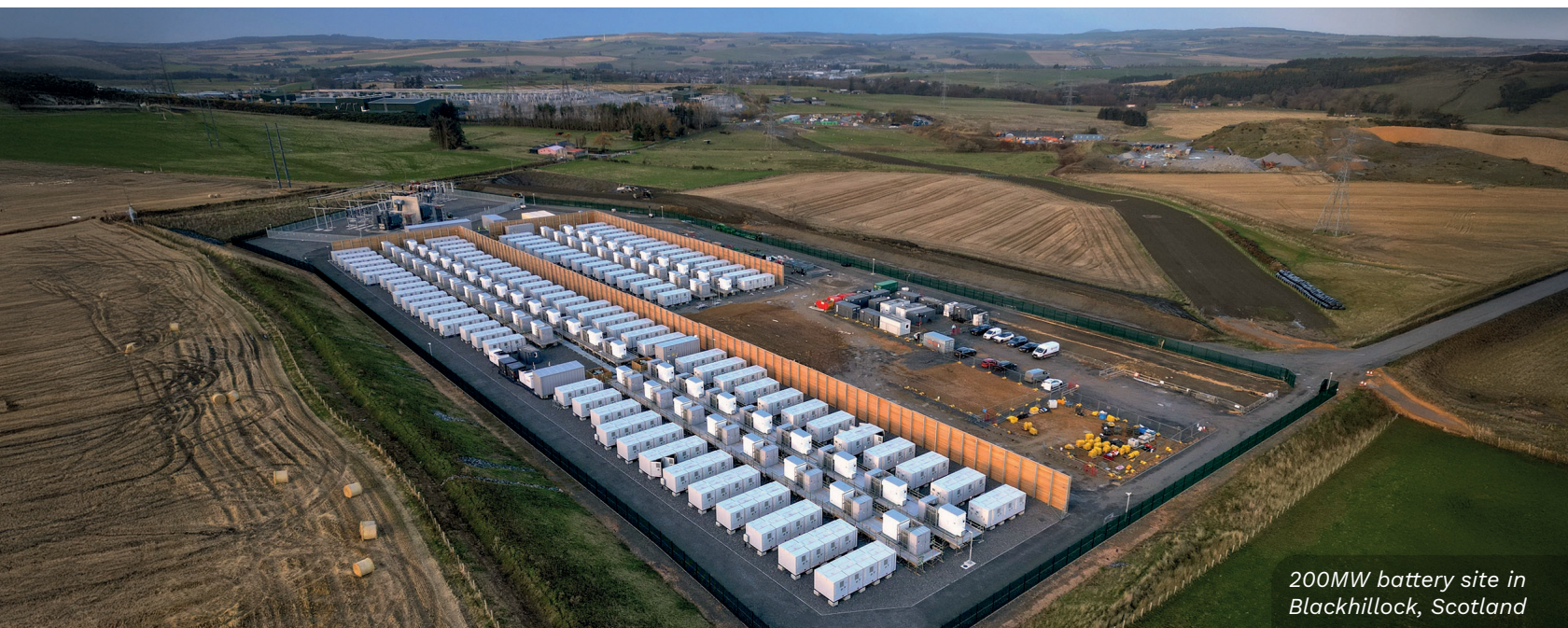
200MW battery site in Blackhillock, Scotland